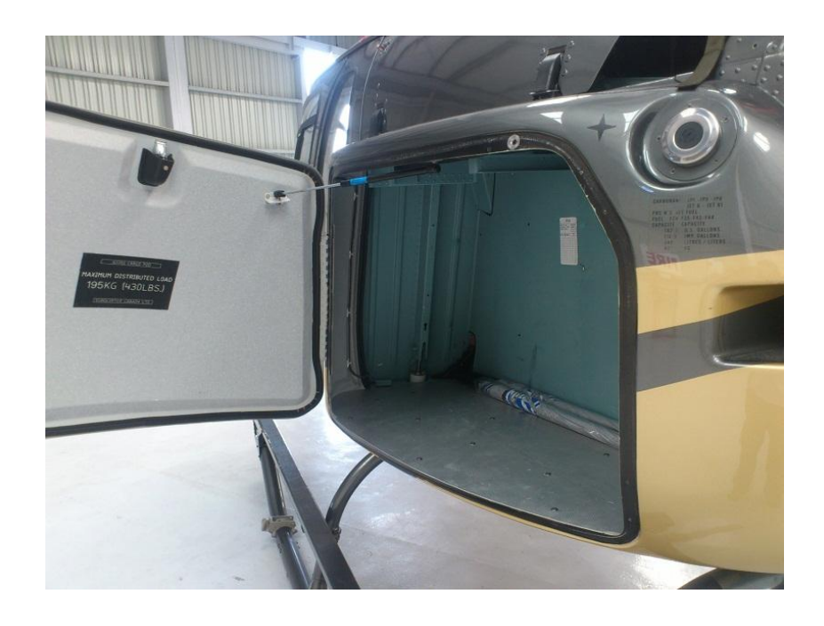
Type A - 23 KG